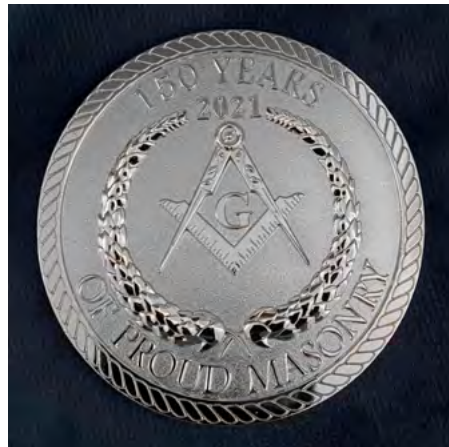
Actual size is 3 inches round