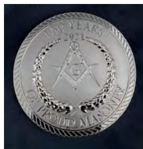
Actual size is 3 inches round